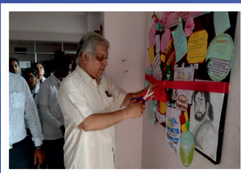
15. Wall Magazine