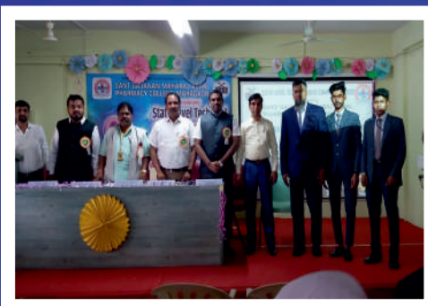
13. MSBTE Quiz Competition