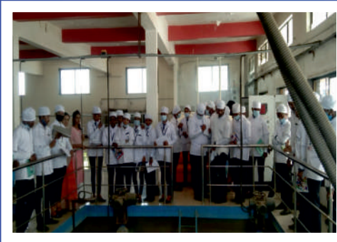
3. Water purification plant visit