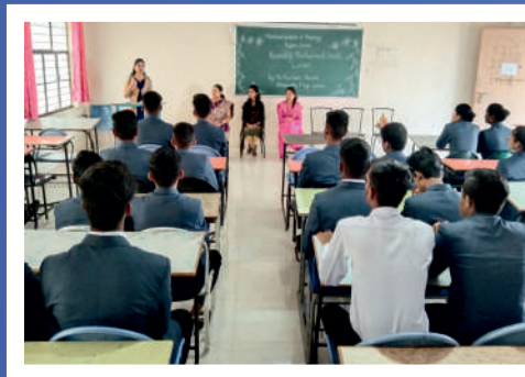
10. Guest lecture – Personality Development