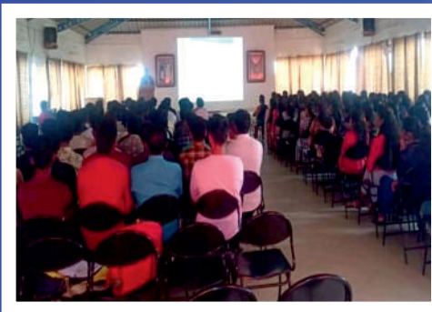
9. Industry Expert Lecture.