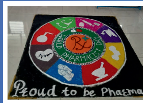
11. Rangoli Competition