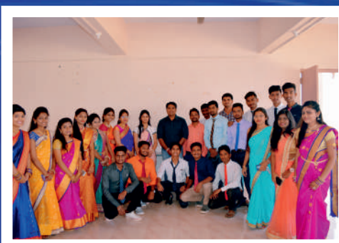
21. Saree Day and Tie Day