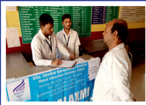
8. Patient Counselling Session.