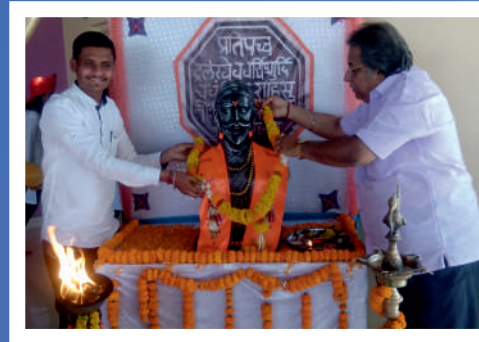
5. Shiv Jayanti Celebration