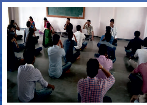
16. International Yoga day