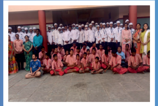
6. Orphanage visit for mentally retarded children school