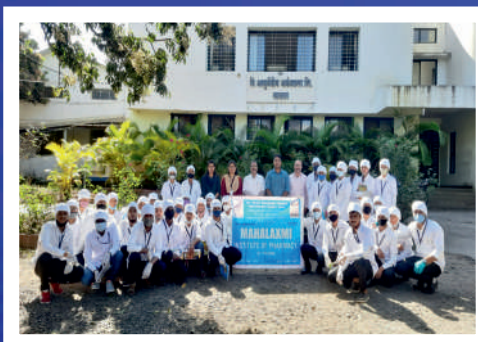
14. Industrial visit to Ayurvediya Arkashala Pvt. Ltd.