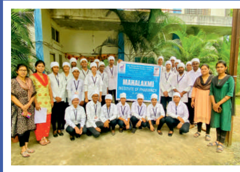
4. Pharma distributor visit.