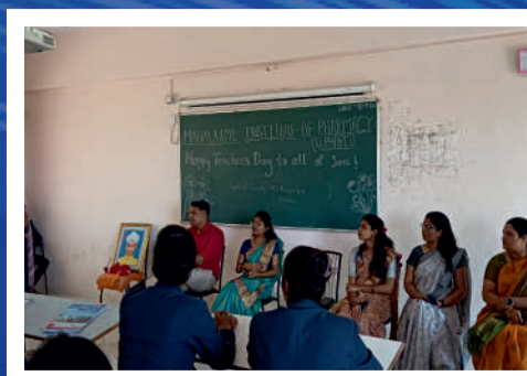
22. Teacher's Day