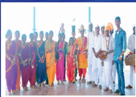
20. Days celebration in College