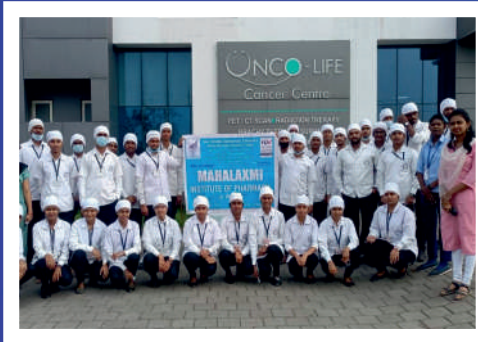
2. Onco-Life cancer care Hospital