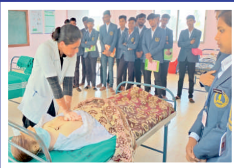
7. BMI Camp and CPR demonstration