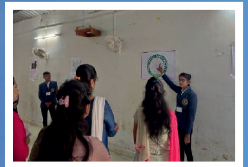
12. Poster Presentation Competition