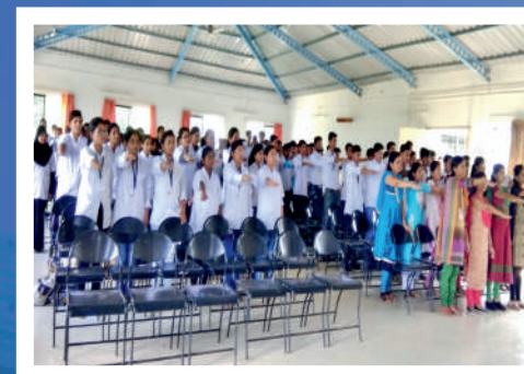
17. World Pharmacist's Day