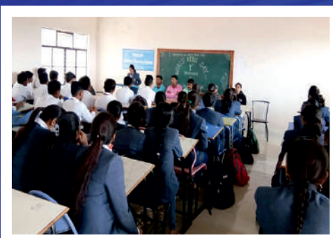
19. World AIDS Day