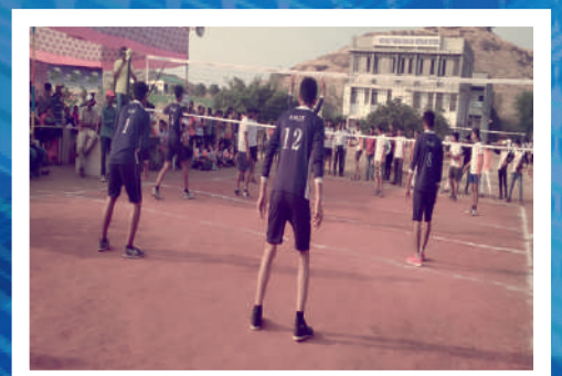
24. SKS Pharma sports